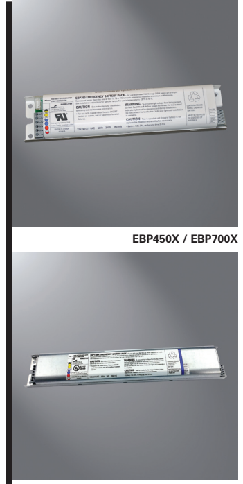
EBP450X / EBP700X